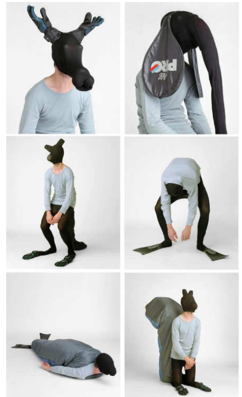
How many costumes can you create using a stocking hat, pair of gloves, a tennis cover, swimming flippers, a sleeping bag, and a pair of plain black tights?